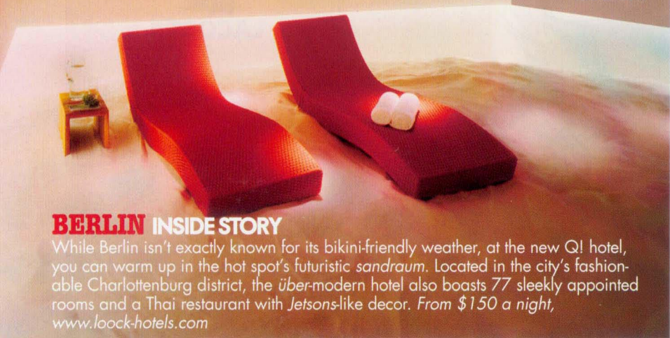
Q! hotel's sauna room