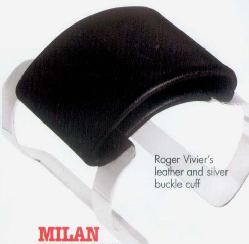
Roger Vivier's leather and silver buckle cuff

While Berlin isn't exactly known for its bikini-friendly weather, at the new Q! hotel, you can warm up in the hot spot's futuristic sandraum . Located in the city's fashionable Charlottenburg district, the über -modern hotel also boasts 77 sleekly appointed rooms and a Thai restaurant with Jetsons -like decor. From $150 a night, www.loock-hotels.com