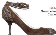
£235 Gwendolyn Carrié