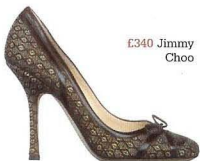
£340 Jimmy Choo