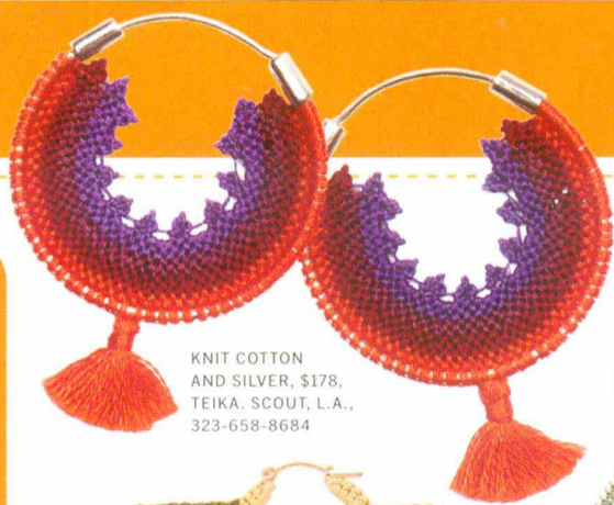
KNIT COTTON AND SILVER, $178, TEIKA. SCOUT, L.A., 323-658-8684

colorful stitched hoops are a fresh take on the artsy, handmade-looking jewelry trend. We love how they're intricately detailed and low-key at the same time.