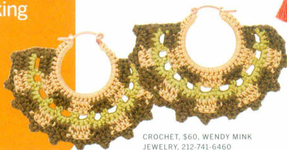
CROCHET, $60, WENDY MINK JEWELRY, 212-741-6460